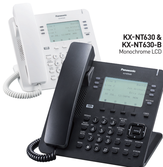
KX-NT630 & KX-NT630-B Monochrome LCD